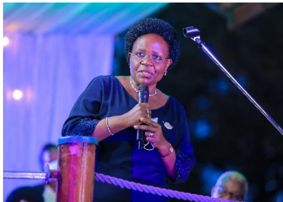
Picture 2: Hon Minister for Karamoja and Woman Member of Parliament for Manafwa District, Hon. Dr. Mary Goretti Kitutu [TGS OG 1977-1983] presents her remarks at the Launch.

A total of 207 people [193 females and 14 males] attended the event comprising of the Guest of Honour, four headteachers [the incumbent and three former headteachers], 183 OGs, 10 Associates from St. Peters College Tororo Old Boys' Association (SPECTOBA) and one from Bukedi College Kachonga Old Boys' Association. Eight of the total number in attendance were well-wishers. Biographies illustrating the distinguished and dedicated service of the Guest of Honour and five school administrators were delivered during the event.