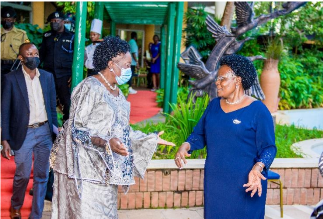
Picture 1: Hon Minister for Karamoja receives the Guest of Honor Rt. Hon. First DPM at the Launch.

The Association was officially inaugurated at a ceremony officiated by the Rt. Honourable 1 st Deputy Prime Minister (DPM), Minister of East African Community Affairs (MEACA) and Woman Member of Parliament for Kamuli District, Hon. Rebecca Alitwala Kadaga. Former Headteachers and the incumbent Headteacher of TGS graced the occasion. Notably members of the Association, the Honourable Minister for Karamoja Affairs, Hon. Dr Mary Goretti Kitutu, judicial officers 2 , representatives of government Ministries, Departments and Agencies were in attendance. OGS