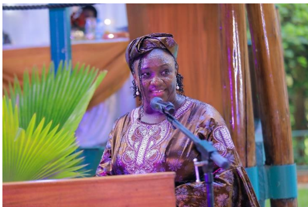
Picture 5: Vice-Chairperson TGSAA delivers remarks on behalf of the Association.

The Vice Chairperson of the Alumni Association thanked the Hon. Guest of Honor for sparing time off her busy schedule to officiate the launch. She provided an overview of the Association and enumerated the Association's benefits to include; diverse networking, nomination and election into office, representation in high profile social events, possible investment opportunities, recommendation to institutions of higher learning and sponsorship, social support and access to Association's facilities. She appealed to the Old Girls to sign-up to the Association's membership and noted that a Patron, Associate and Honorary Members would also be identified and/or encouraged to join.